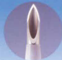
SURFLO is known for its SHARPNESS .

Terumo SURFLO® I.V. CATHETER is designed and manufactured under stringent global quality standards, including electron beam sterilization and ISO quality management/color code systems, for easier, surer and safer use.